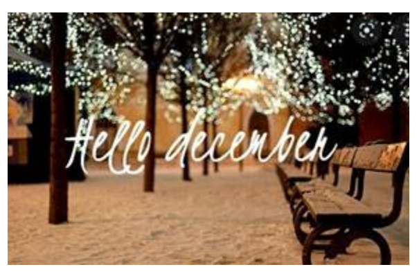
MESSAGE FROM THE PRINCIPAL